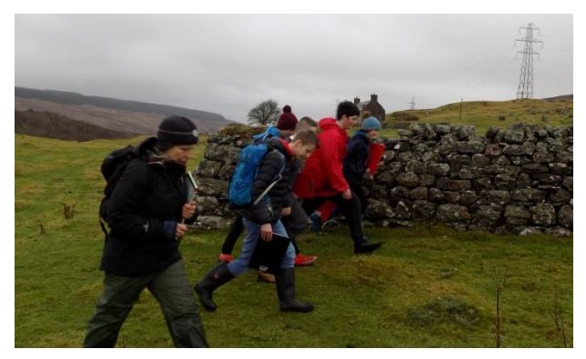
Here the students undertake pacing out of the site, recording the findings as they go